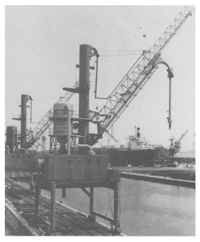
FIG. 4. Typical large ship unloading installation with pneumatic suction line.

Figure 4 shows a typical ship unloading installation employing several pneumatic suction lines. Pneumatic unloading is the most popular because of ease of operation and flexibility to perform in most any kind of vessel. Port cranes and ships' tackle are also widely used to operate clam-type buckets similar to that used in the copra ship unloading.