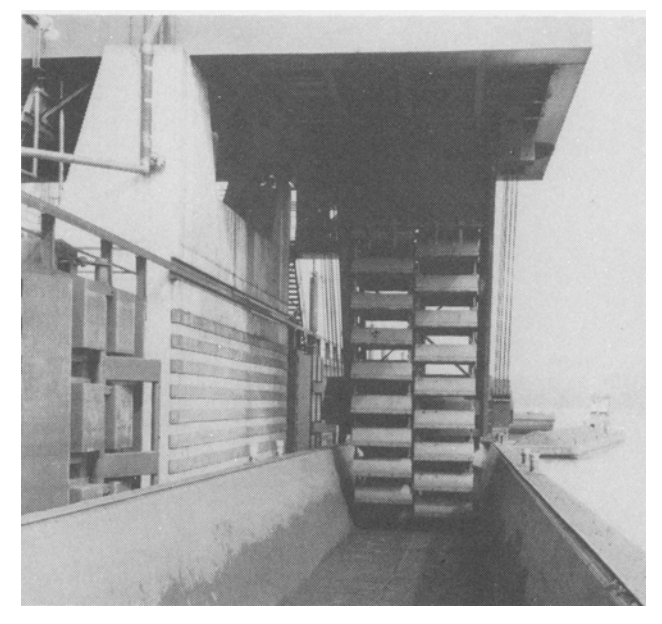
FIG. 1. Marine leg. J. AM. OIL CHEMISTS' SOC., June 1976 (VOL. 53)

Figure 2 shows a modern sea coast elevator in the U.S. where soybeans and other grains can be loaded into ships at a 2000 ton per hour rate through each of the loading spouts.